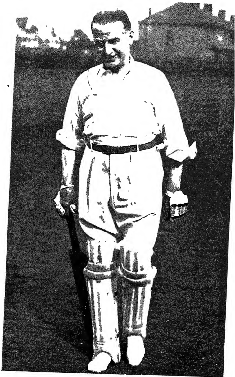
I HOPE I SHALL CARRY MY BAT